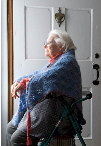
Life Membership Awardee